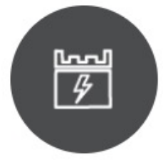
Resilience and Security